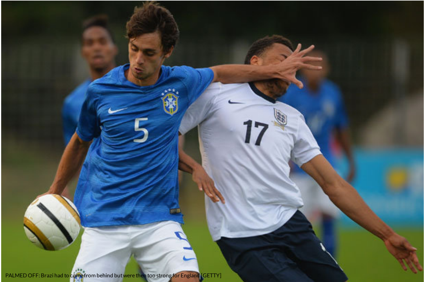
PALMED OFF: Brazil had to come from behind but were then too strong for England

"We know we have more than enough ability in the squad to deal with Korea and we have more than enough attacking threat to put goals past them."