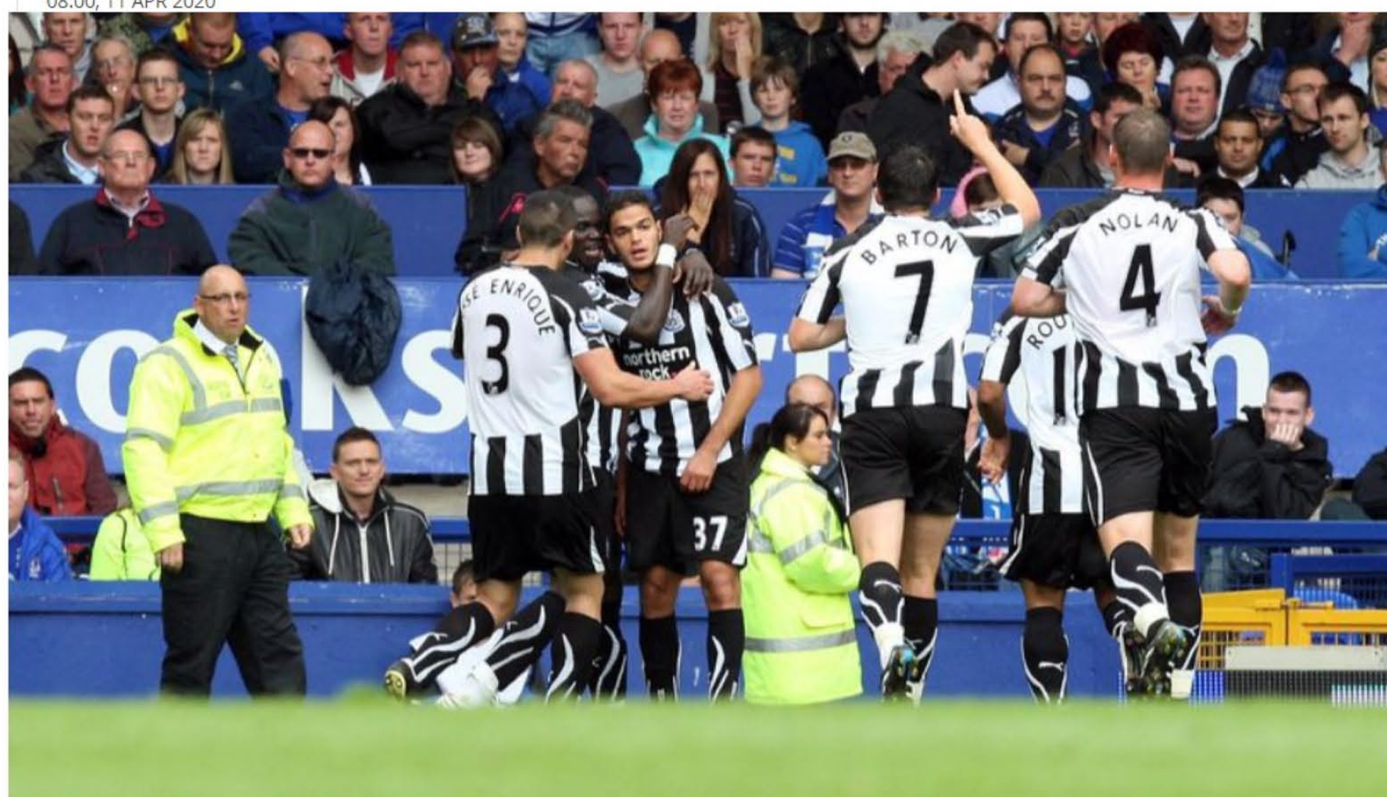
Hatem Ben Arfa of Newcastle United Scores his first goal during the Barclays Premier League match between Everton and Newcastle United

Sign up to FREE email alerts from ChronicleLive - Newcastle United FC